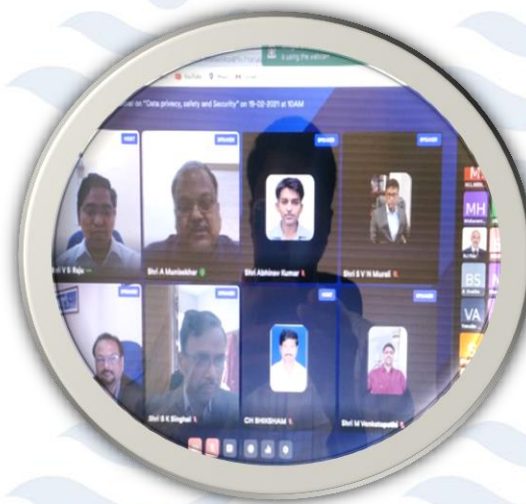
Webinar on “Data Privacy, Safety and Security” held on 19 th February 2021