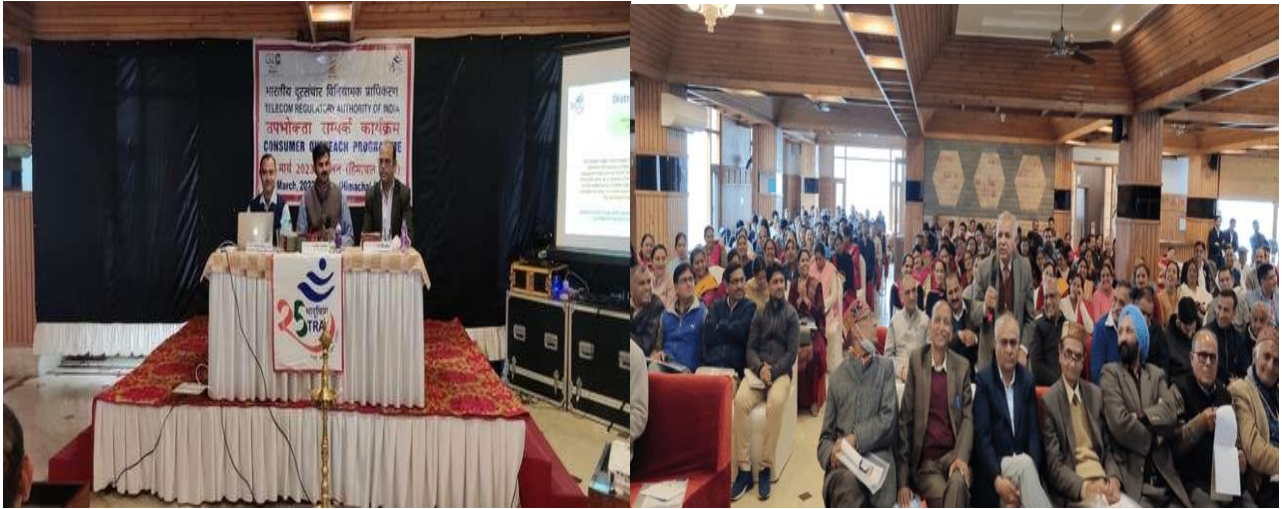
Consumer Outreach Program at Solan (Himachal Pradesh) held on 24 th March 2023 by Regional Office, Delhi