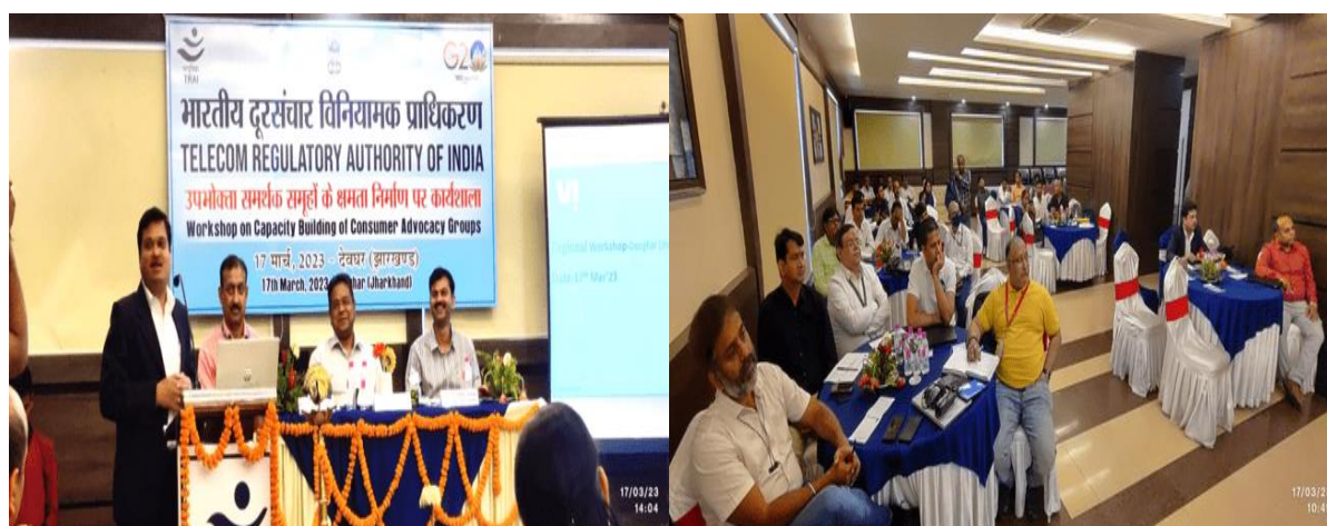
Workshop at Deoghar, Jharkhand on 17 th March 2023