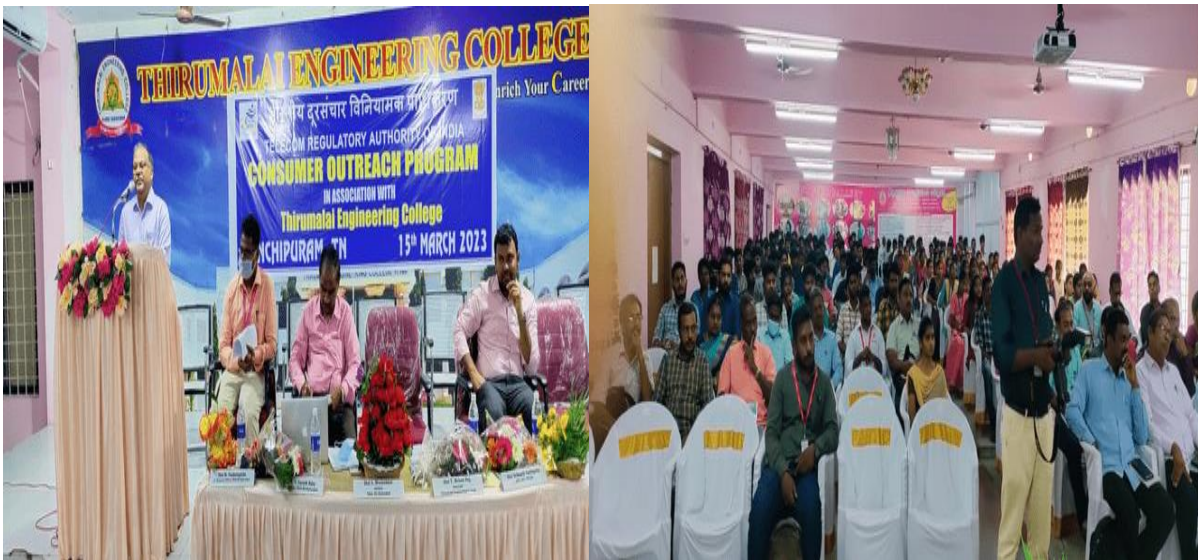
Consumer Outreach Program at Kanchipuram (Tamil Nadu) held on 15 th March 2023 by Regional Office, Hyderabad