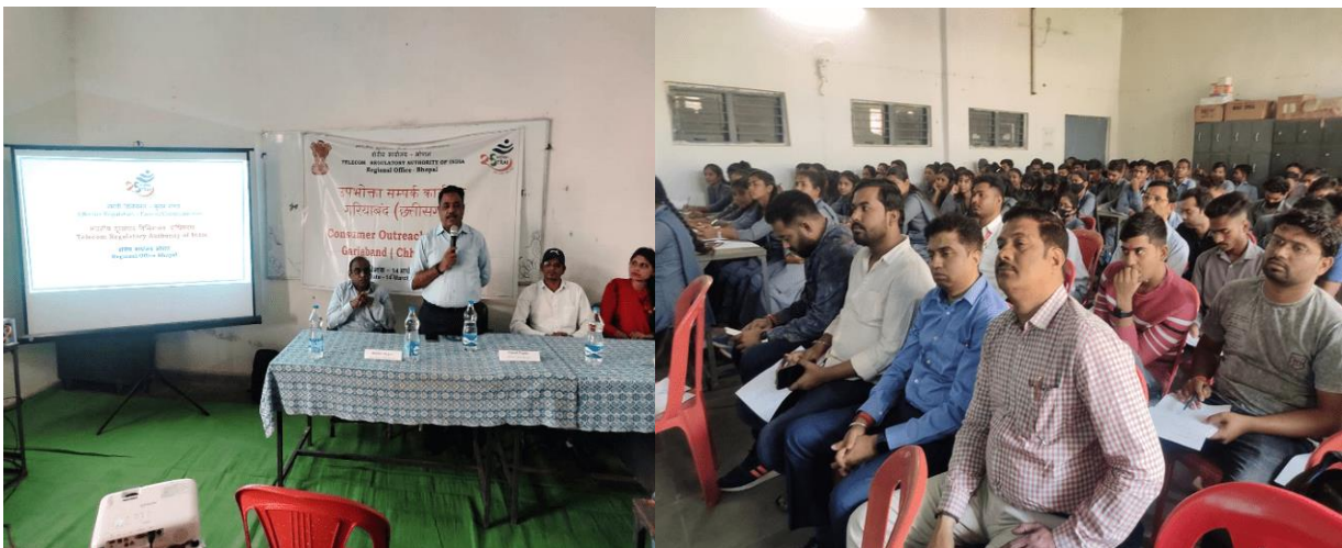
Consumer Outreach Program at Gariaband (Chhattisgarh) held on 14 th March 2023 by Regional Office, Bhopal