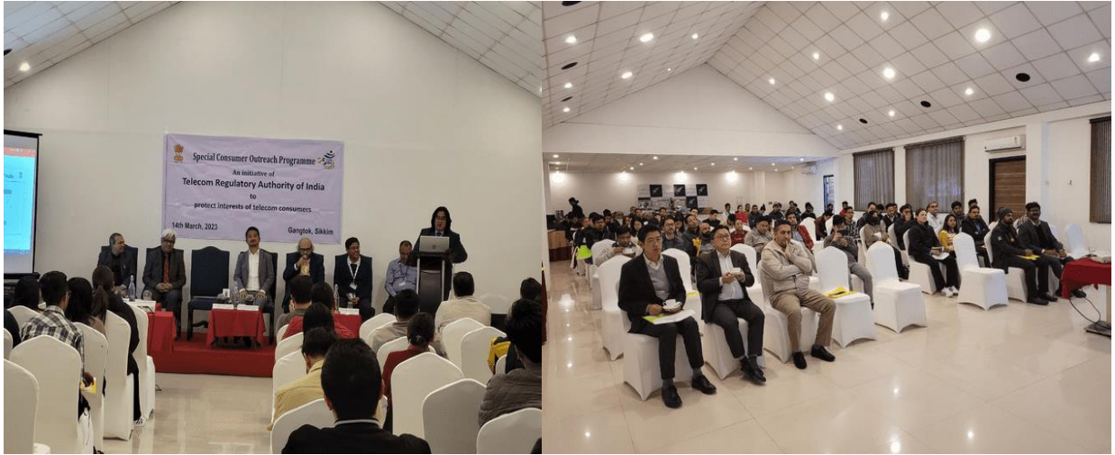
Special Consumer Outreach Program at Gangtok (Sikkim) held on 14 th March 2023 by Regional Office, Kolkata