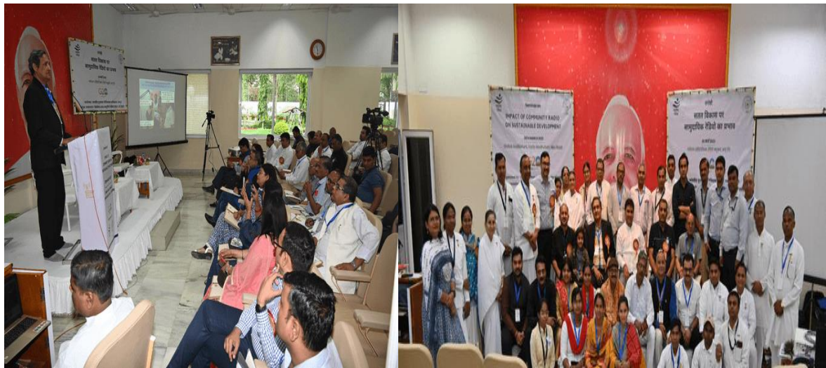
Seminar on “Impact of Community Radio on Sustainable Development on 29 th March 2023