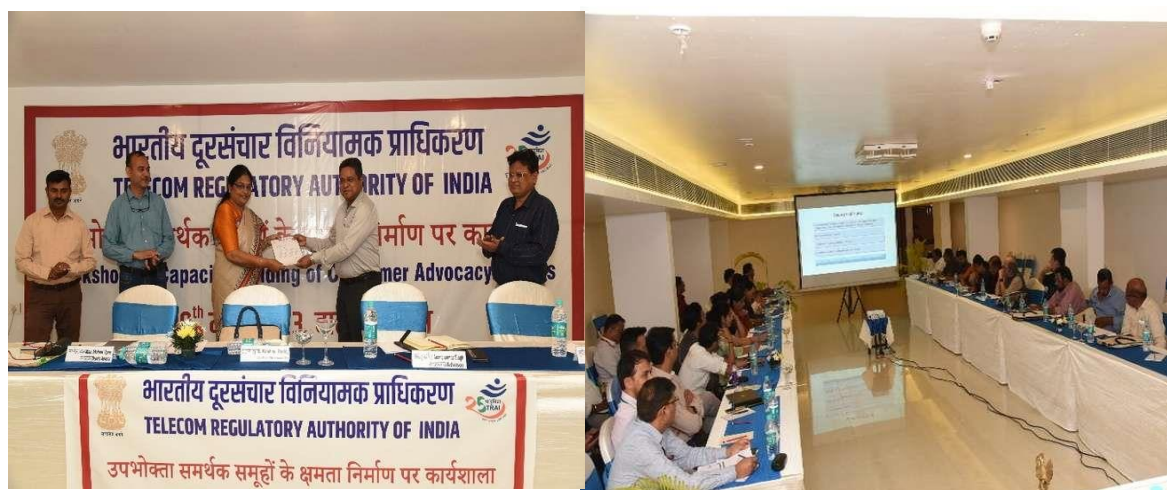
Workshop at Goa on 29 th March 2023