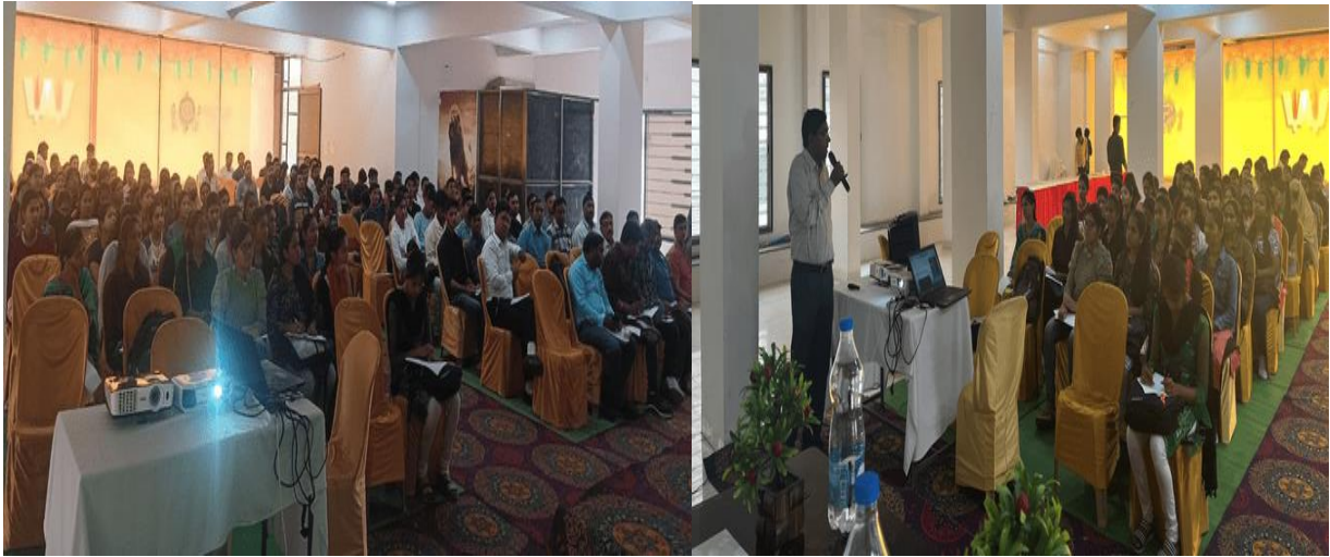
Consumer Outreach Program at Seoni (Madhya Pradesh) held on 15 th March 2023 by Regional Office, Bhopal