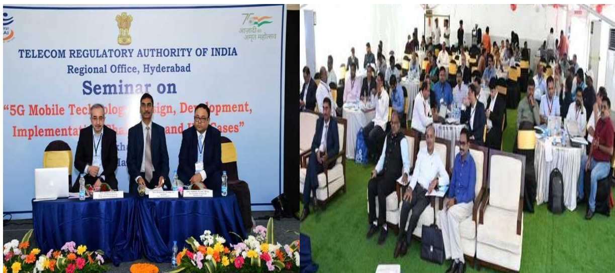
Seminar on “Introduction to 5G Mobile Technology, Design, Development and Implementation Challenges and Use Cases” on 31 st March 2023