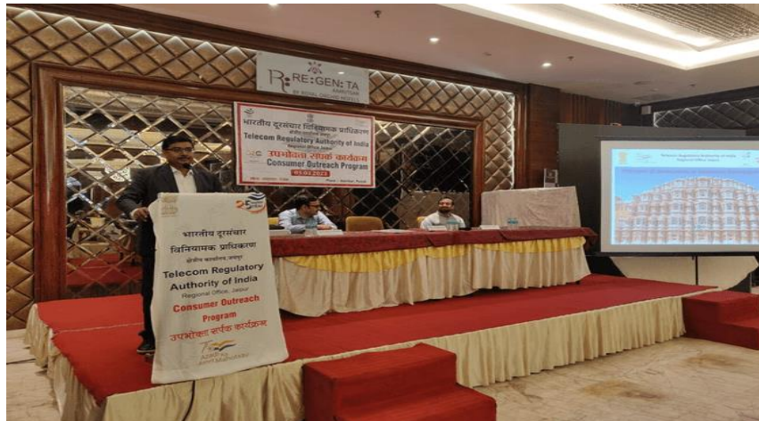
Consumer Outreach Program at Amritsar (Punjab) held on 3 rd March 2023 by Regional Office, Jaipur