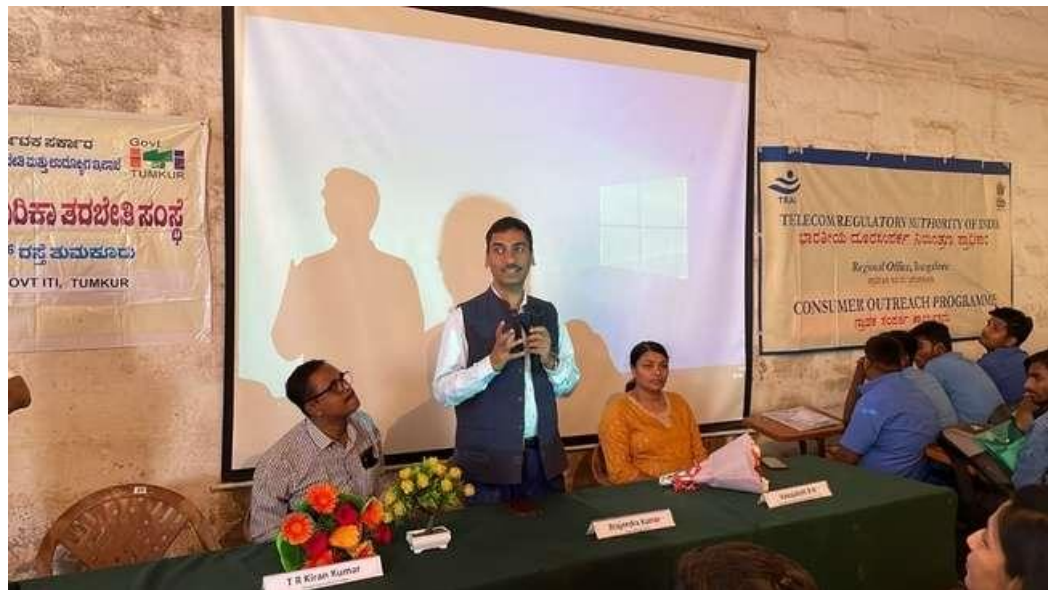
Consumer Outreach Program at Tumkur (Karnataka) held on 27 th March 2023 by Regional Office, Bengaluru