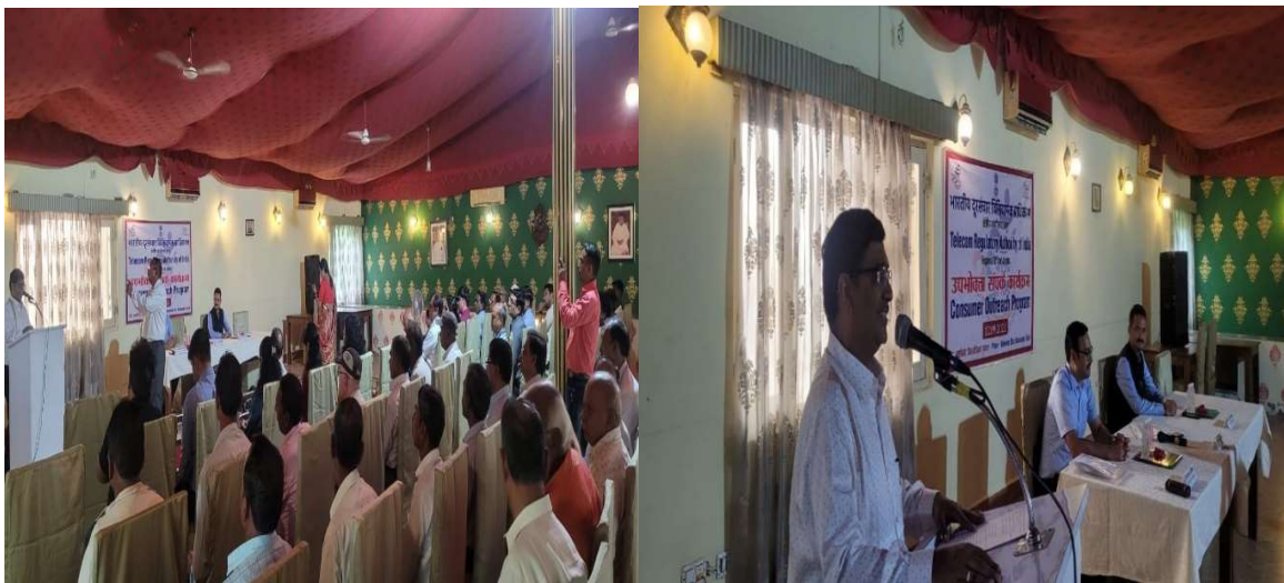
Consumer Outreach Program at Balasinor, Mahisagar, Gujarat on 12 th September 2022 by Regional Office, Jaipur