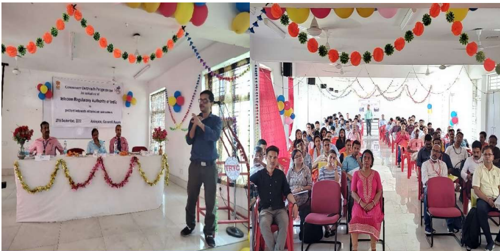
Consumer Outreach Program at Amingaon, Guwahati (Assam) held on 27 th September 2022 by Regional Office, Kolkata