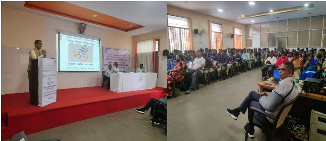
Consumer Outreach Program on 2 nd September 2022 at Bengaluru (Karnataka) by Regional Office, Bangalore