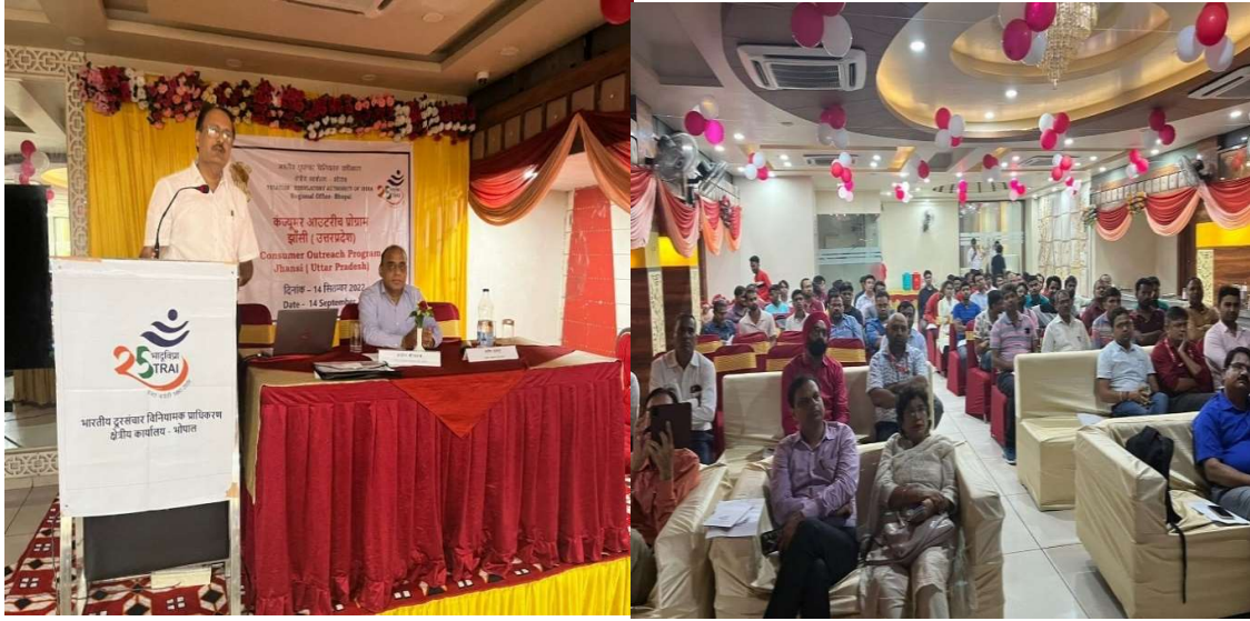
Consumer Outreach Program at Jhansi, Uttar Pradesh on 14 th September 2022 by Regional Office, Bhopal