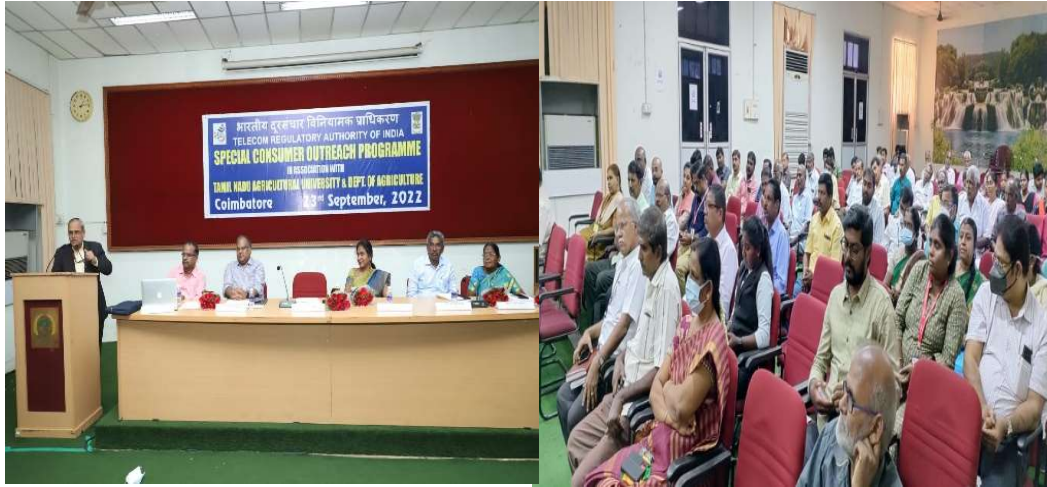
Secretary, TRAI, New Delhi was addressed at the Special Consumer Outreach Programme for farmers & agricultural students at Tamil Nadu Agricultural University (TNAU), Coimbatore (Tamil Nadu) on 23 rd September 2022