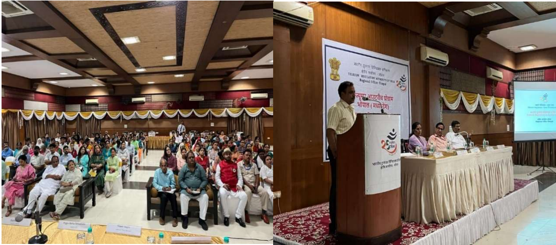
Special Consumer Outreach Program organized at Bhopal (Madhya Pradesh) on 7 th September 2022 focusing on women participants by Regional Office, Bhopal