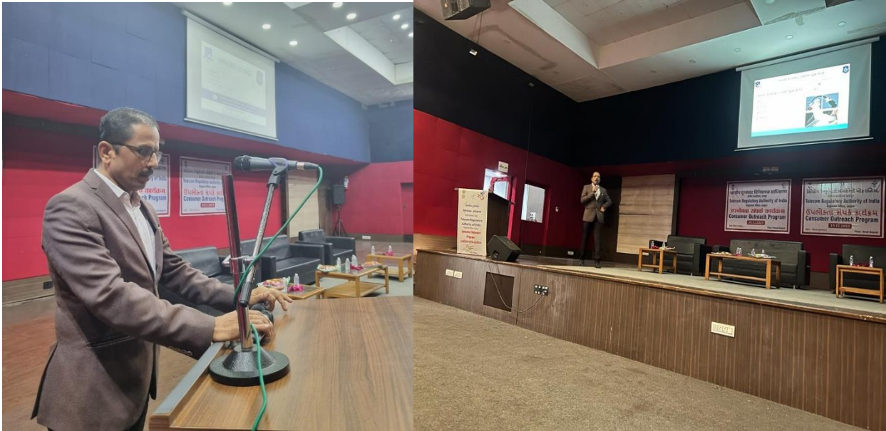
Consumer Outreach Program at Botad (Gujarat) on 19 th December 2023 by RO Jaipur