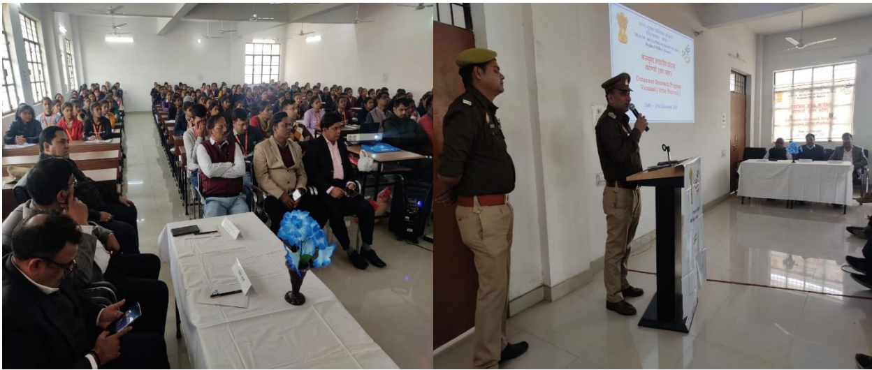
Consumer Outreach Program at Varanasi (Uttar Pradesh) on 21 st December 2023 by RO Bhopal