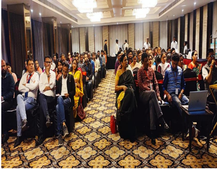
Consumer Outreach Program at Mahaveer Nagar (Raipur) on 26 th December 2023 by RO Bhopal