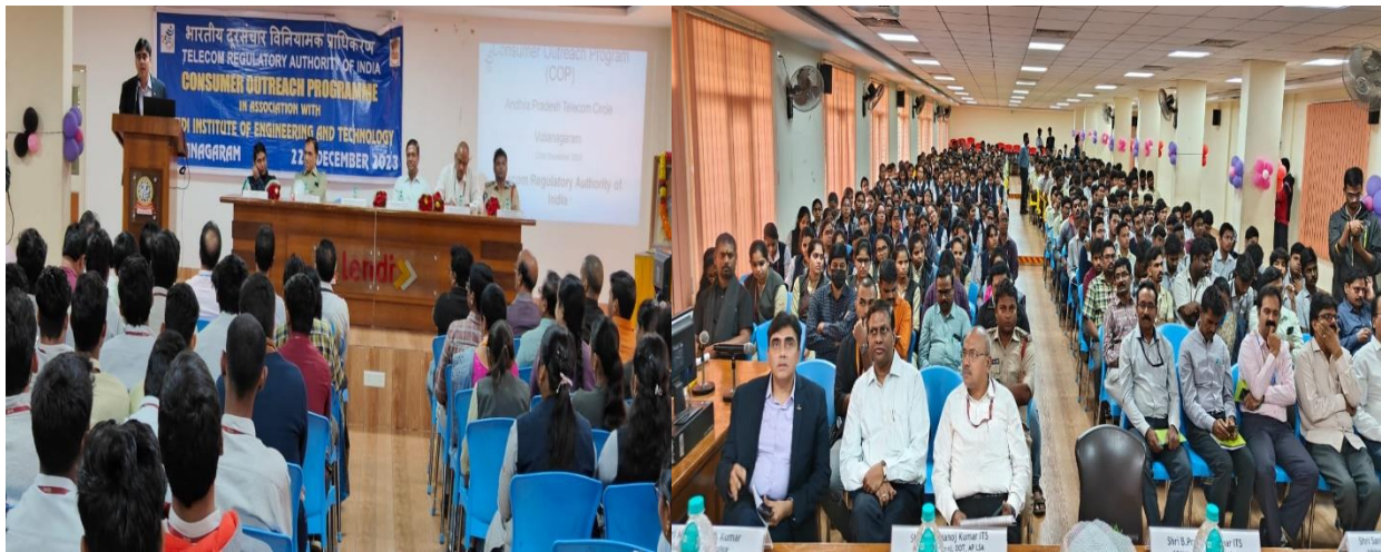
Consumer Outreach Program at Vizianagaram (Andhra Pradesh) on 22 nd December 2023 by RO Hyderabad