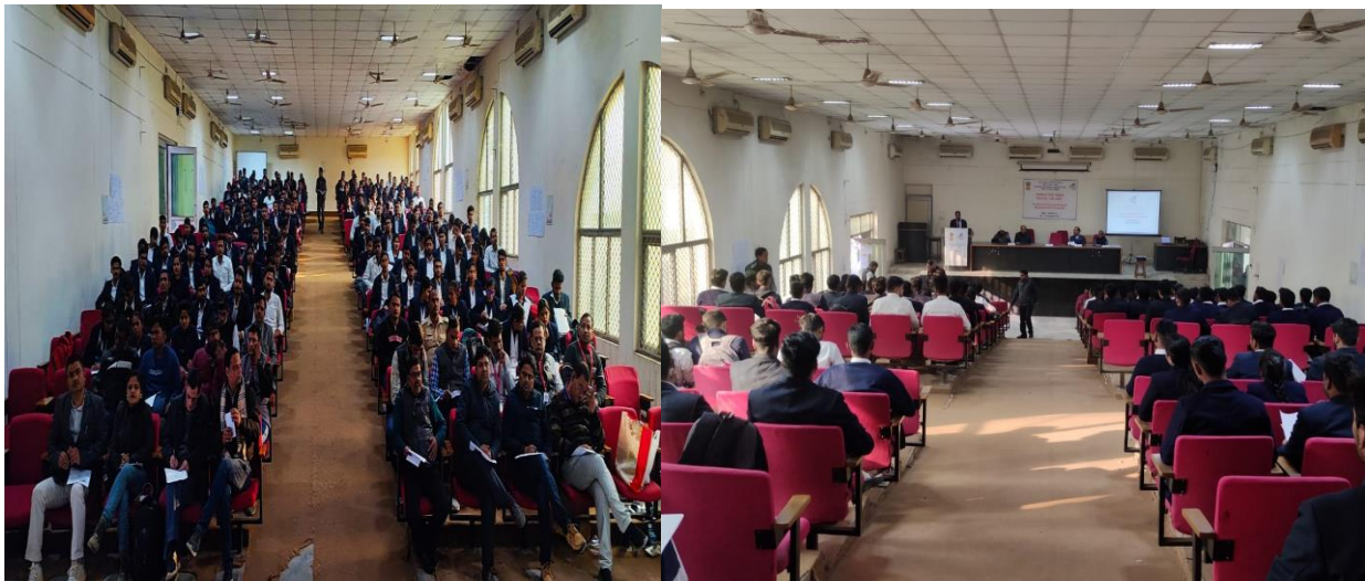
Consumer Outreach Program at Prayagraj (Uttar Pradesh) on 20 th December 2023 by RO Bhopal