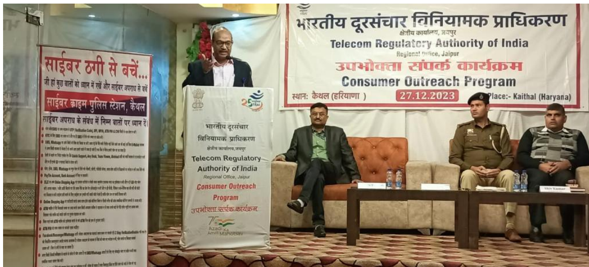
Haryana police cyber crime expert taking awareness session in Consumer Outreach Program at Kaithal (Haryana) on 27 th December 2023 by RO Jaipur