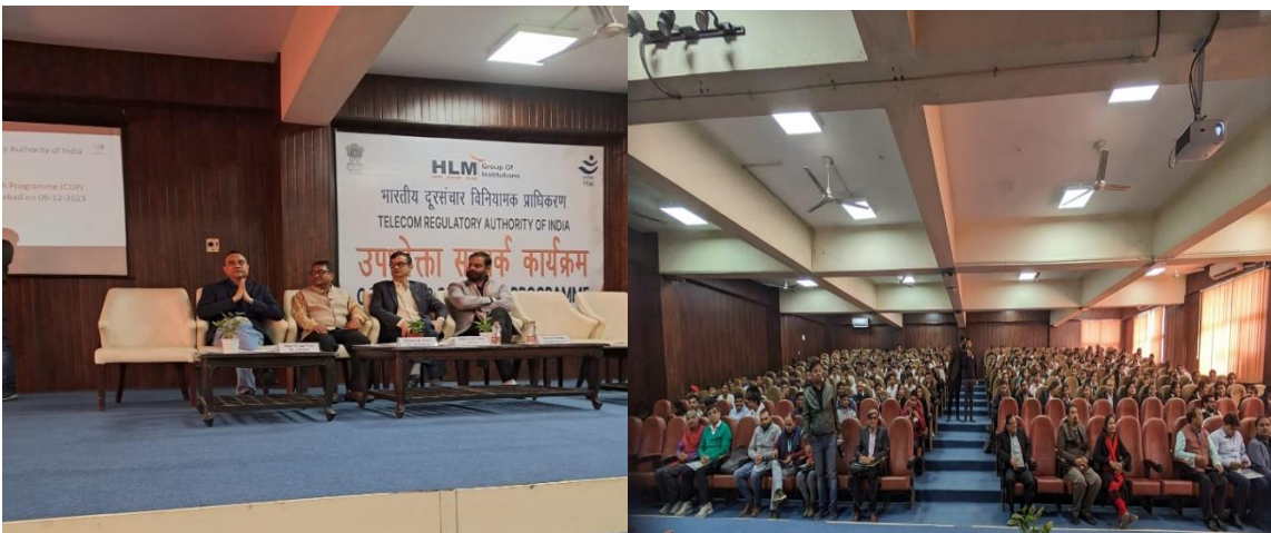
Consumer Outreach Program at Ghaziabad (Uttar Pradesh) on 6 th December 2023 by TRAI, HQ New Delhi