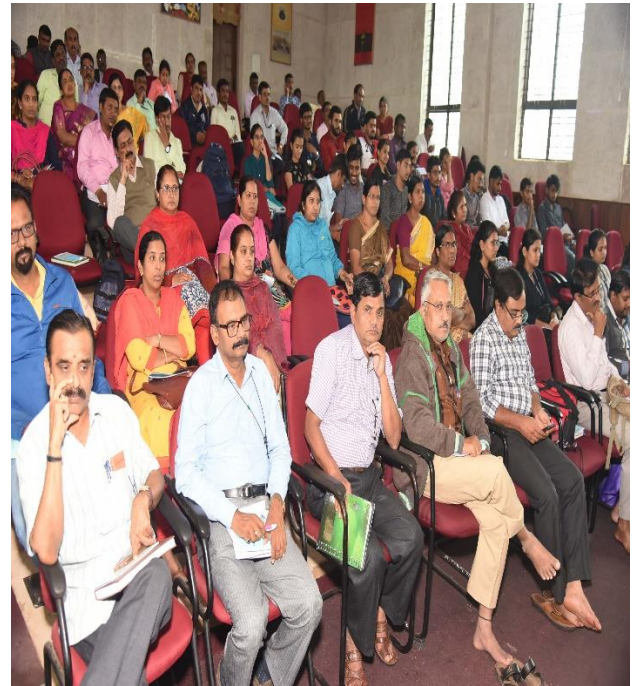
CoP at Davanagere (Karnataka) held on 08.08.2019