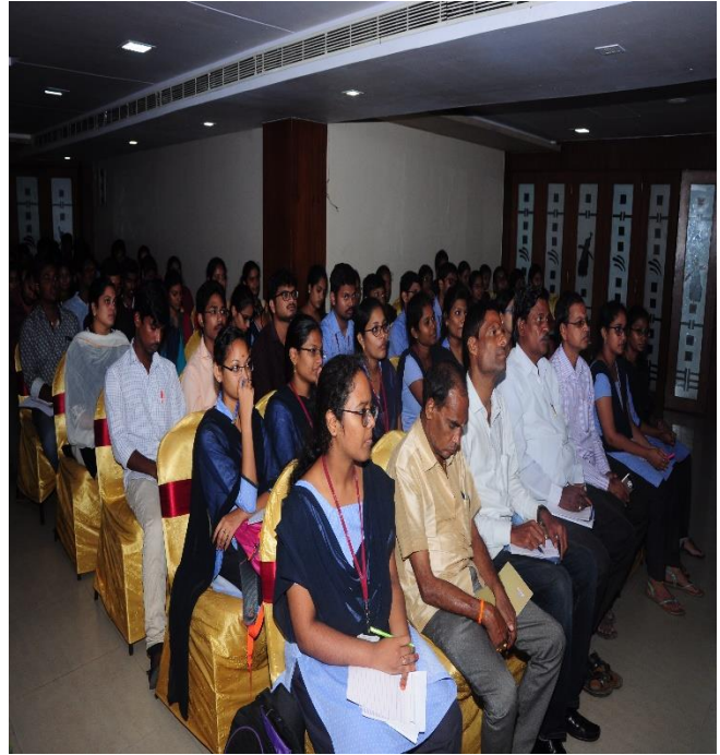
CoP at Vizianagaram (Andhra Pradesh) held on 01.08.2019