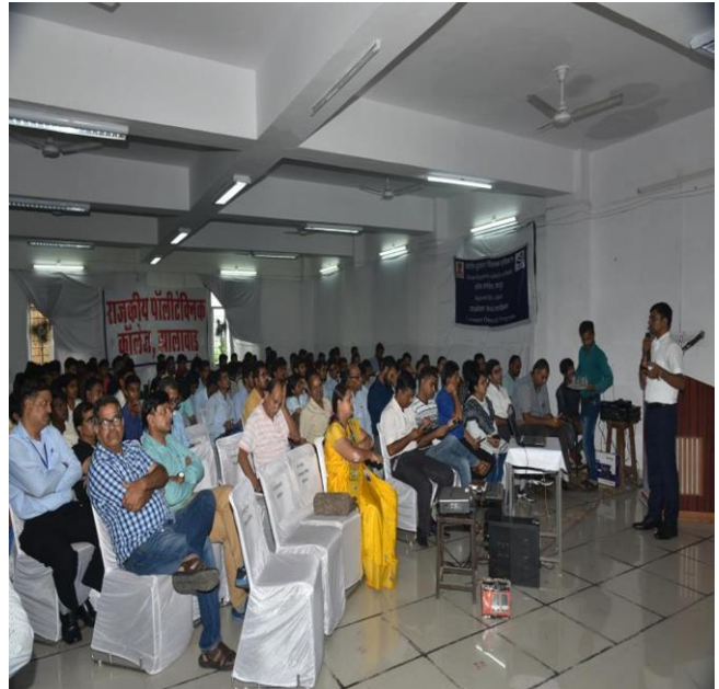
CoP at Jhalawar (Rajasthan) held on 28.08.2019