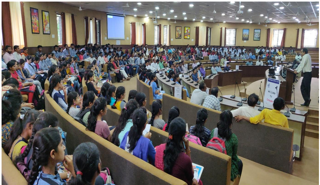
CoP at Washim (Maharashtra) held on 21.08.2019