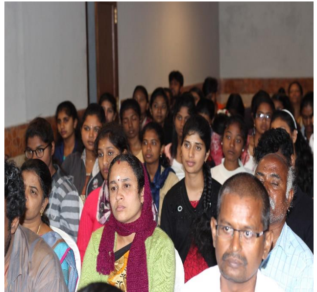
CoP at Coonoor (Tamilnadu) held on 08.08.2019