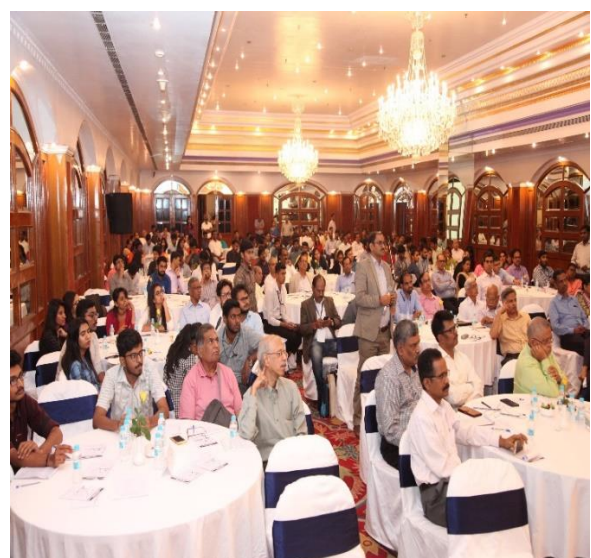
Seminar on “5G-Technology” at Vasanth Nagar (Bangalore) held on 29.08.2019