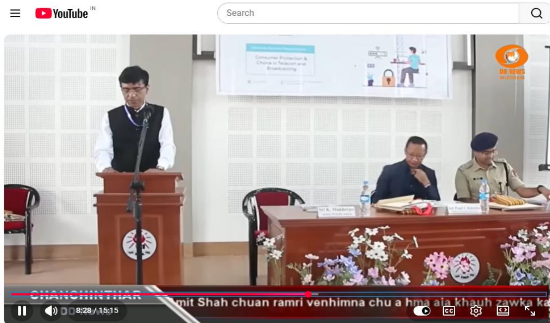
DD News Mizoram Chanchintha | 22 May 2026 | 6:30 PM

https://www.youtube.com/live/Bx7IHxr-Pvs