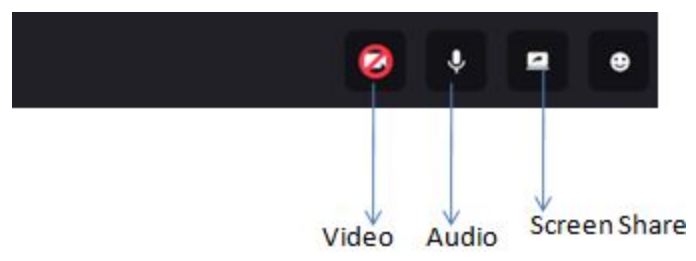
Fig: Icons at the extreme right

Fig: Icons on the bottom of the screen for turning off/on camera, mic and screen sharing.