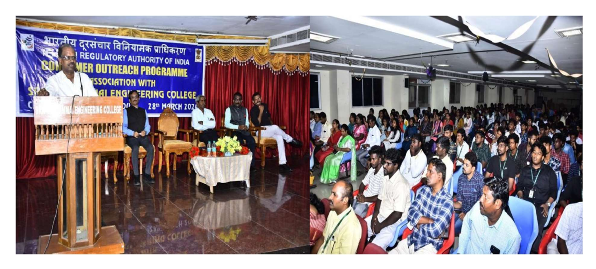
Consumer Outreach Program at Chengalpattu (Tamil Nadu) on 28<sup>th</sup> March 2024 by RO Hyderabad