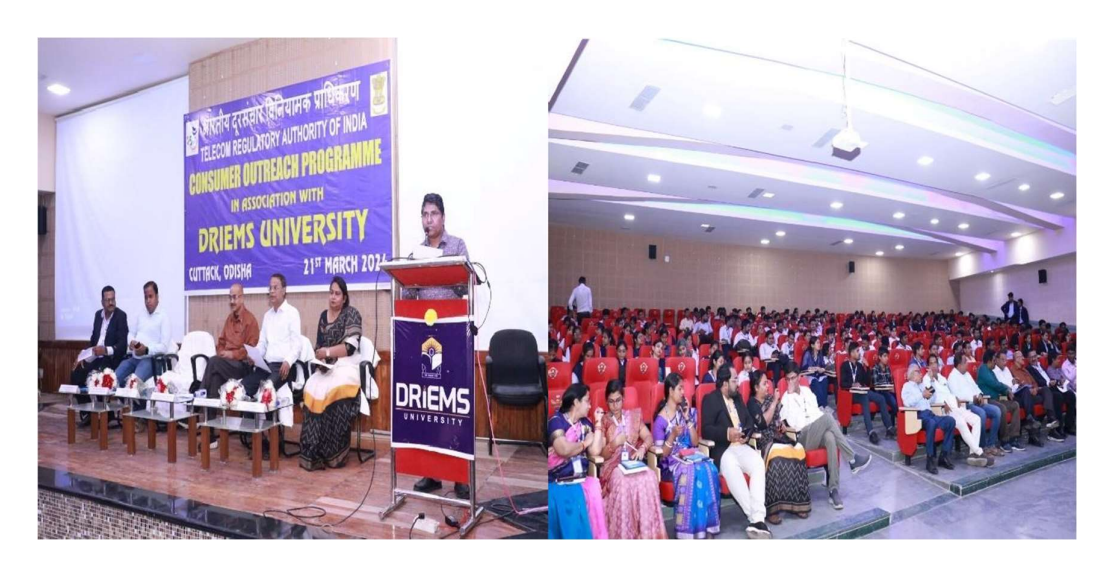
Consumer Outreach Program at Cuttack (Odisha) on 21st March 2024 by RO Hyderabad