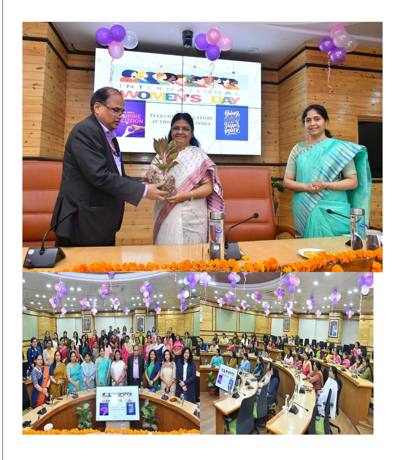
Celebration of International Women's Day in TRAI Headquarters Office on 8th March 2024