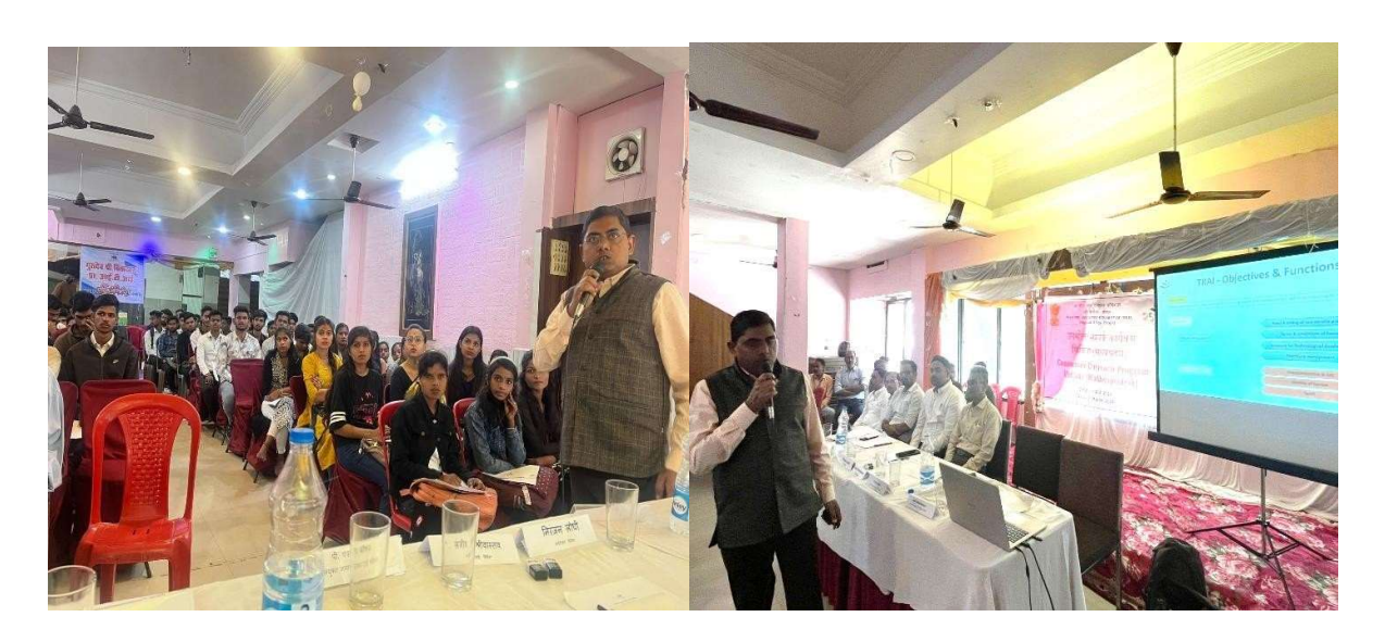
Consumer Outreach Program at Vidisha (Madhya Pradesh) on 06<sup>th</sup> March 2024 by RO Bhopal