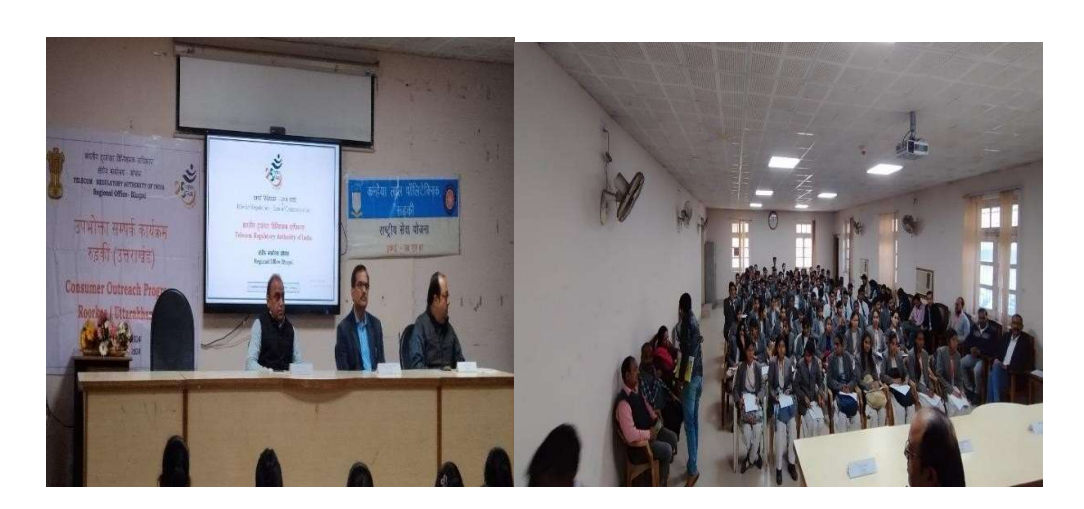
Consumer Outreach Program at Roorkee (Uttarakhand) on 07<sup>th</sup> March 2024 by RO Bhopal