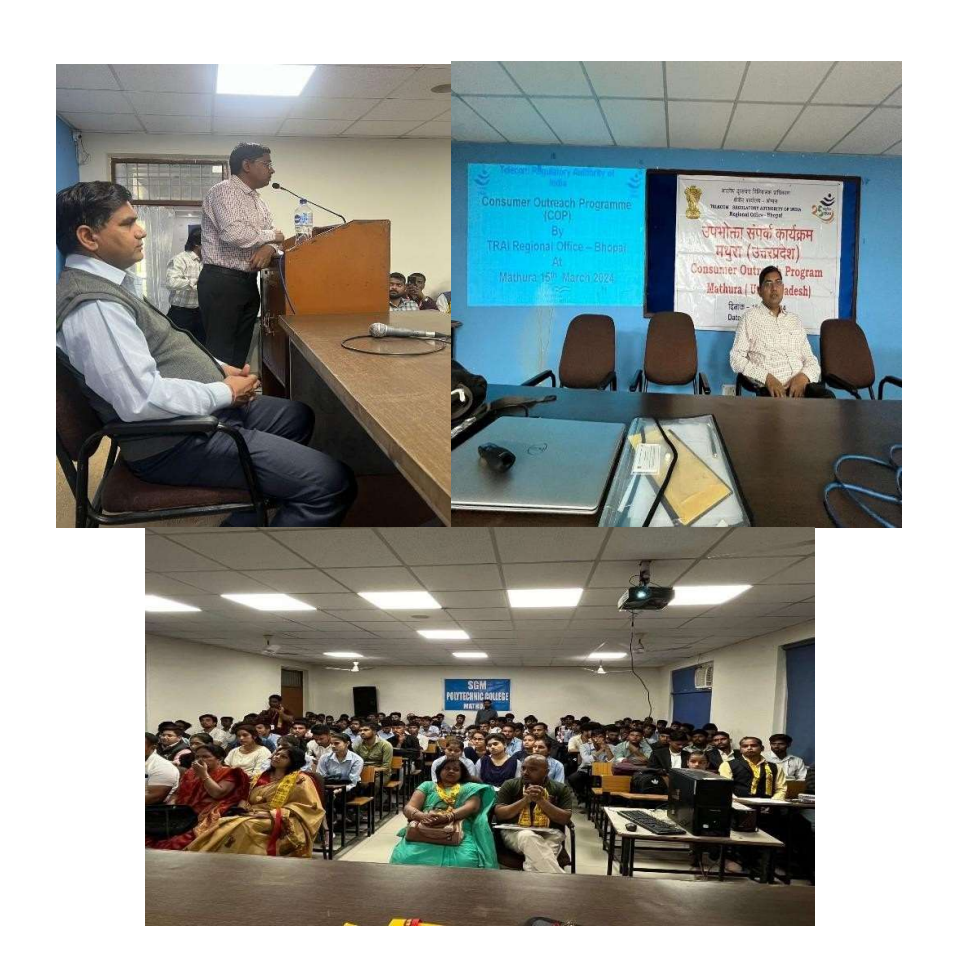
Consumer Outreach Program at Mathura (Uttar Pradesh) on 15<sup>th</sup> March 2024 by RO Bhopal