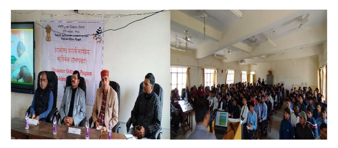
Consumer Outreach Program at Rishikesh (Uttarakhand) on 05<sup>th</sup> March 2024 by RO Bhopal

Full details of the Directions/Orders/Consultation Paper/Report, Subscription Data, etc mentioned in this newsletter are available on TRAI website www.trai.gov.in