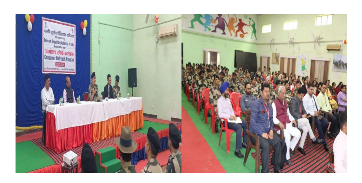
Consumer Outreach Program at Khasa Cantt (Punjab) on 22<sup>nd</sup> March 2024 by RO Jaipur