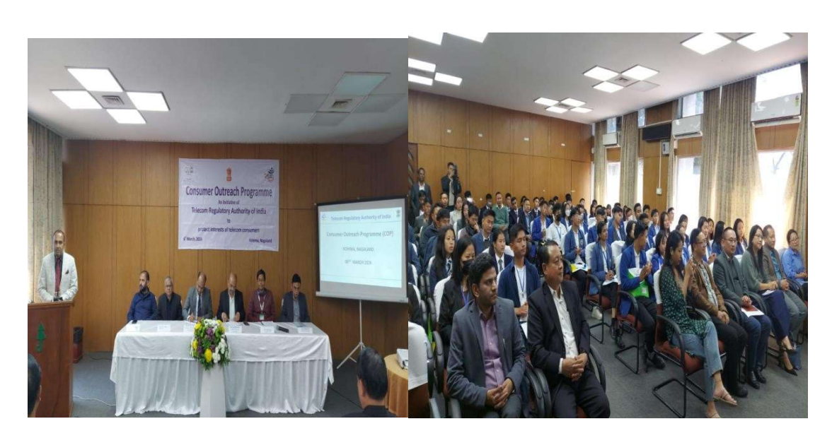
Consumer Outreach Program at Kohima (Nagaland) on 06<sup>th</sup> March 2024 by RO Kolkata