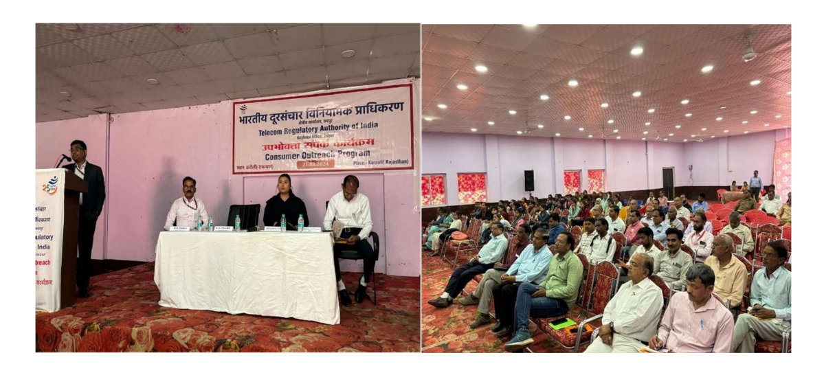
Consumer Outreach Program at Karauli (Rajasthan) on 21st March 2024 by RO Jaipur