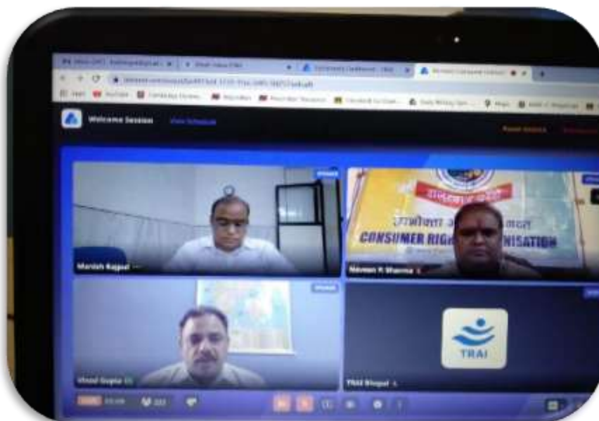
CoP for Madhya Pradesh held on 29 th October 2021

Full details of the Directions/Orders/Consultation Paper/Report, Subscription Data, etc mentioned in this newsletter are available on TRAI website