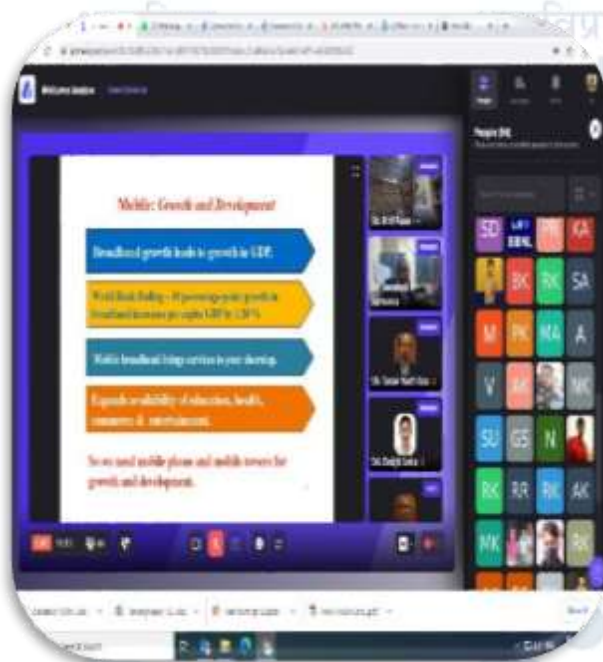
CoP for Patna, (Bihar) held on 26 th October 2021