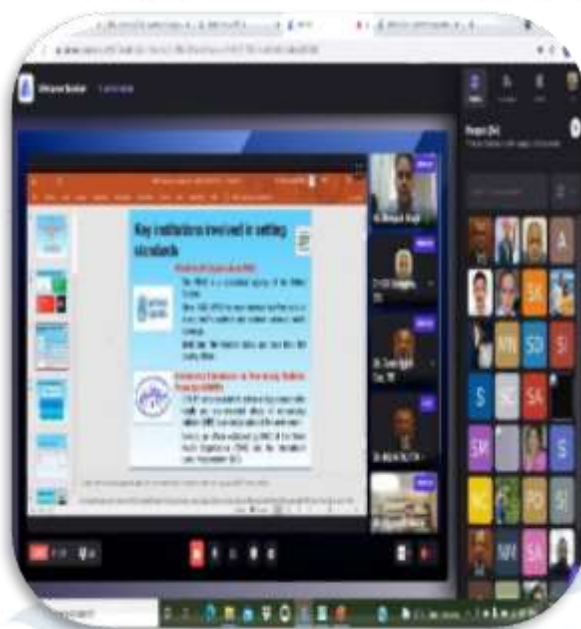
CoP for Port Blair, A&N Islands held on 8 th October 2021