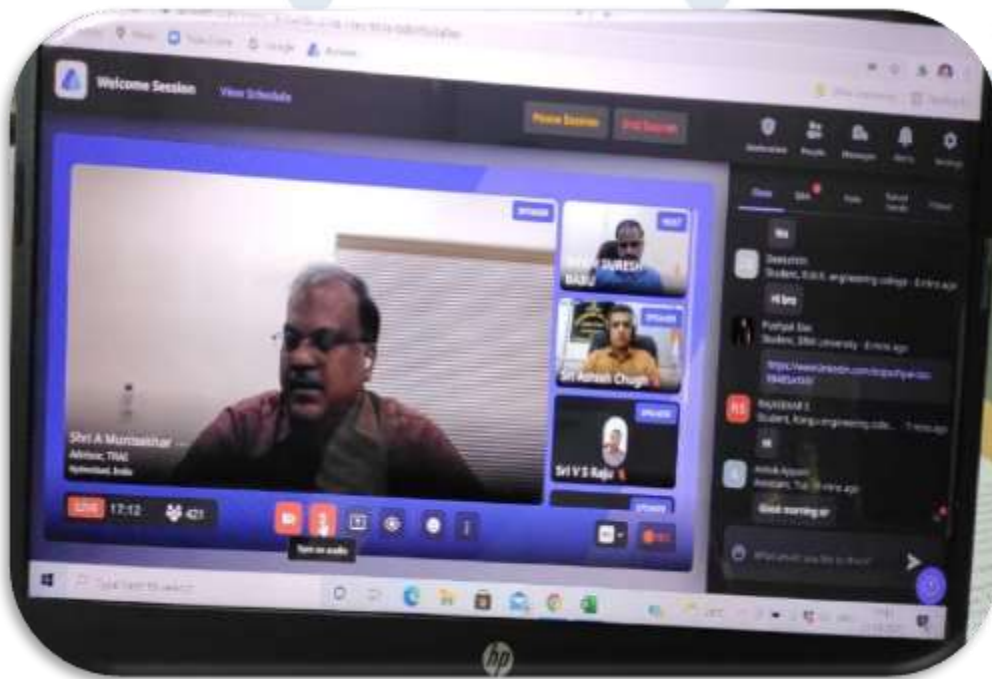
CoP for Tamilnadu held on 21 st October 2021