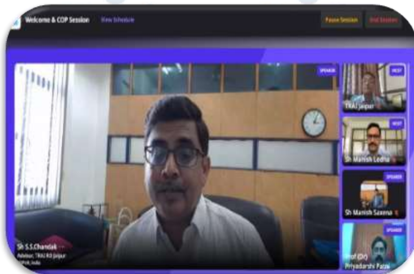
CoP for Rajasthan held on 29 th October 2021